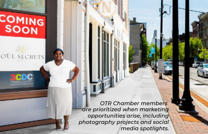
OTR Chamber members are prioritized when marketing opportunities arise, including photography projects and social media spotlights.